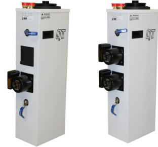
QT Flow Center

B&D Part# 1-230PFCSS-G or M $25.00 Off 1-Pump Unit B&D Part# 2-230PFCSS-G or M $50.00 Off 2-Pump Unit