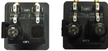
Pressurized Flow Center

B&D Part# 1-230POS-G or M $25.00 Off 1-Pump Unit B&D Part# 2-230POS-G or M $50.00 Off 2-Pump Unit