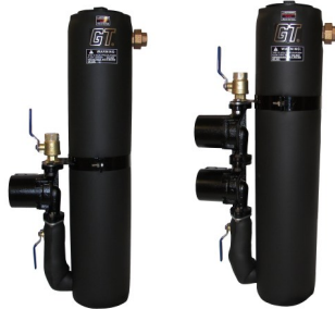
GT Flow Center

B&D Part# 1-230POS-G or M $25.00 Off 1-Pump Unit B&D Part# 2-230POS-G or M $50.00 Off 2-Pump Unit